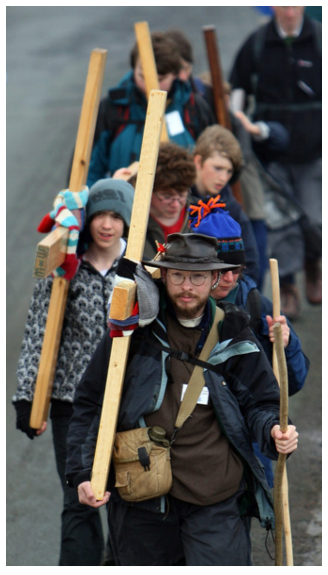
CARRYING THE CROSS: NO SHAME!